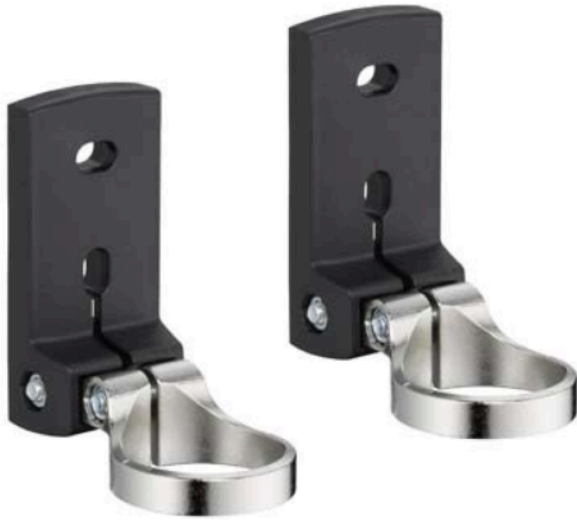
Part no.: 540353 BT-SET-240CCS-E Mounting bracket set