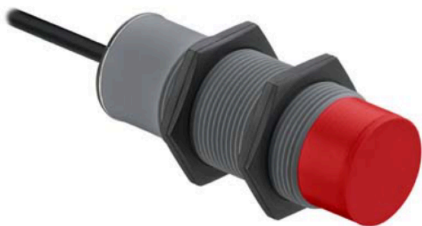
Part no.: 50136626 LCS-2M30P-N30PNC-K020V Capacitive sensor