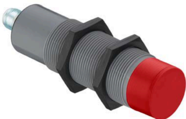
Part no.: 50136621 LCS-2M30P-N30PNO-M12 Capacitive sensor