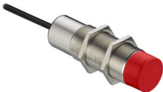
Part no.: 50136619 LCS-2M30B-N30NNO-K020V Capacitive sensor