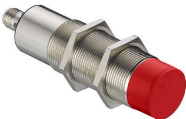
Part no.: 50136614 LCS-2M30B-N30PNC-M12 Capacitive sensor