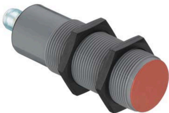
Part no.: 50136558 LCS-2M30P-F20PNC-M12 Capacitive sensor