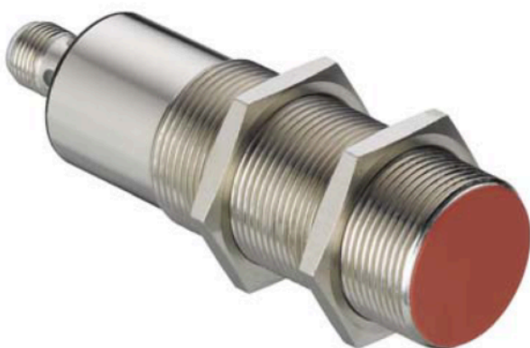
Part no.: 50136549 LCS-2M30B-F20PNO-M12 Capacitive sensor