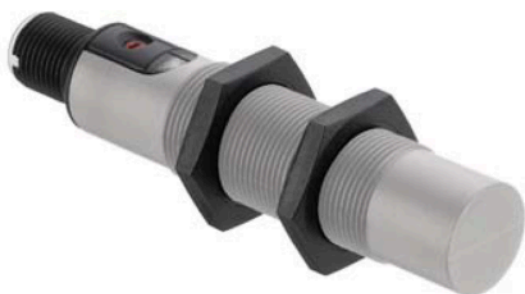
Part no.: 50135782 LCS-1M18P-N15NNC-K020P Capacitive sensor