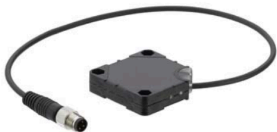
Part no.: 50135742 LCS-1Q40P-F20BNP-K020P Capacitive sensor