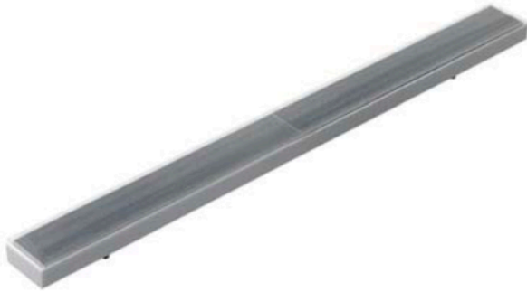
Part no.: 50124004 REF 6-S-26x280 Reflector