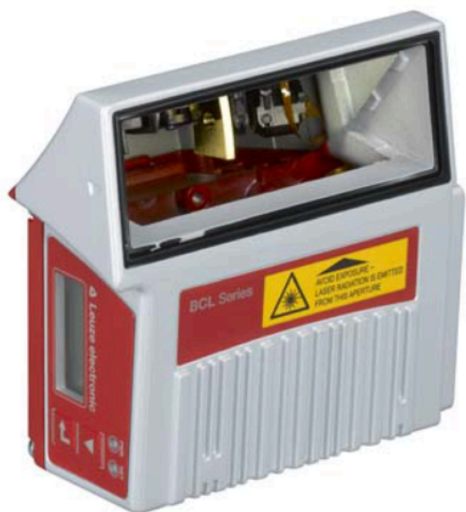
Part no.: 50116440 BCL 348i SF 100 D Stationary bar code reader