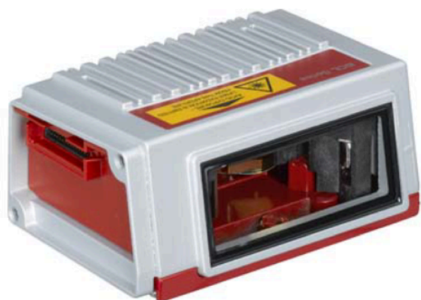
Part no.: 50114822 BCL 308i SF 102 D Stationary bar code reader