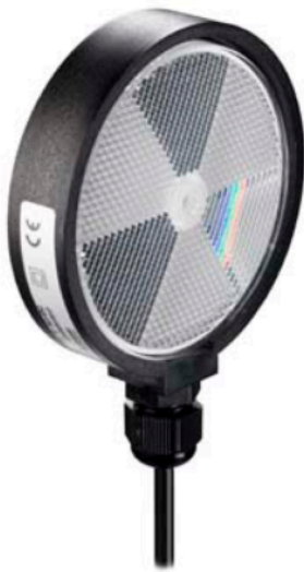
Part no.: 50000071 HTK 82-24V Reflector